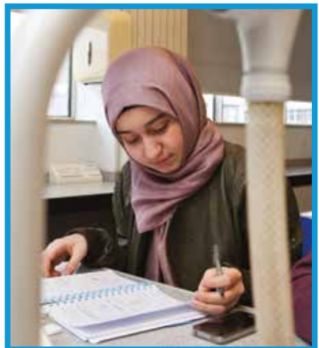
A learner on an Access to HE Diploma course at The College of Haringey, Enfield and North East London