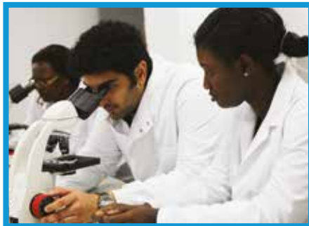
Learners at Coventry University College.

Coventry University College specialises in offering learners the opportunity to gain higher education qualifications in a varied and flexible way which fits more closely with their lifestyle and commitments outside study. Their research discovered a market for mature learners who were keen to pursue a degree to upgrade their skills but lacked the necessary qualifications to gain entry into university. So the College chose to deliver Access to HE courses, which have proved to be a huge success for their learners. Some have gained entry into top universities and have also been awarded bursaries.