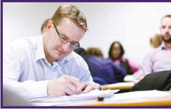
A student at London South Bank University, which has a partnership arrangement with OCN London